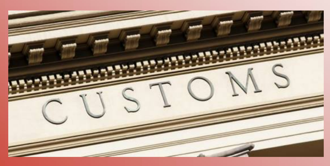
A member of the Herfurth Group

For most kind of goods you have to pay duties and for some customers in the Netherlands VAT (no art.23/deferment). When there are high amounts involved we will ask for advance payments.